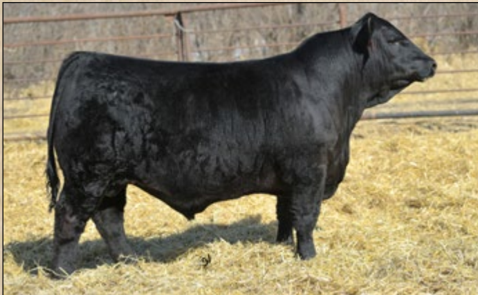
BCLR Manifesto G352 • Service Sire of Lot 35

Consignor: Traxinger Farm - Houghton, SD Miss Traxs M Move G908 is a Major Move female out of a Trax's Rushmore Dam. The major move females have the power house body type that we like, thick, deep ribbed and a rear quarter that tell me she will be a brood cow. She is a 3/4 sib to our other red consignment, (Trax's Miss Move G905), but bred differently. They could make someone a nice pair. Non-diluted. AI bred to WS All-Around Z35 (2675740) on 5/9/20. PE to Bridle Bit Red Rock G9124 (3560970) from 5/15/20 to 6/20/20. Ultrasound safe to AI Date.