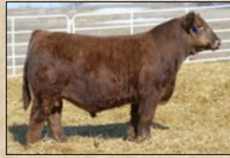
KBHR Sniper - Maternal Sibling to Lot 2B