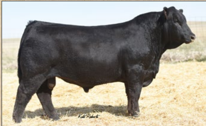
Colorado Bridle Bit E752 • Service Sire of Lot 3

Consignor: Keller Broken Heart Ranch - Mandan, ND Selling 3 IVF Embryos, guaranteeing 1 pregnancy when implanted by a certified embryologist.