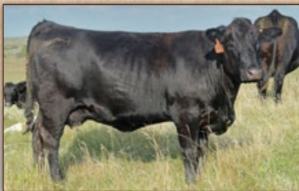
An example of a 2020 1st calf heifer. She weaned off a nice bull calf.