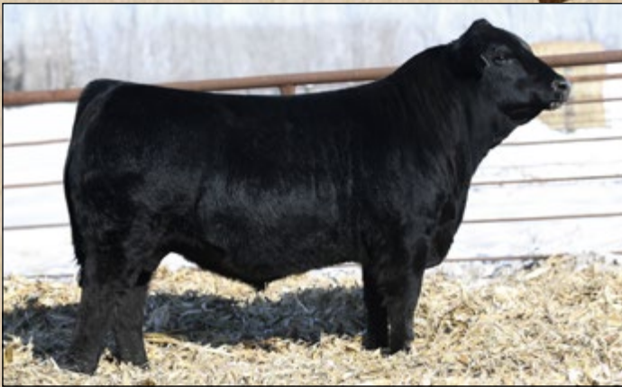
KRJ HZN Direct Impact F805 • Service Sire of Lot 20