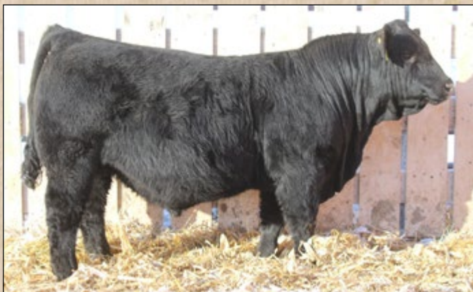
Sys South Prairie E80 • Sire of Lot 49

Consignor: Kaelberer Ranch - New Salem, ND Here is a very performance oriented, Major Move daughter with a likeable EPD profile and a sound set of feet and legs. KR Maternal Moves H55 has all the right tools to become your next front pasture red cow.