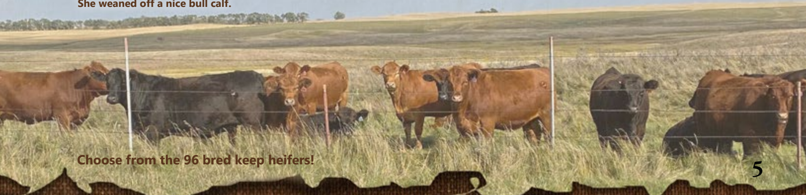
Choose from the 96 bred keep heifers!