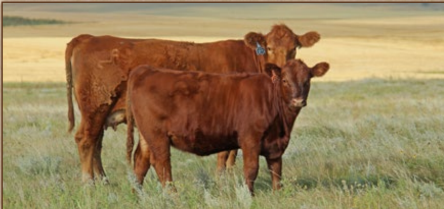
2020 1st calf heifer and her heifer calf before weaning.

We are offering the pick of our replacement bred heifers. This does not include the bred heifers in our Production Sale. There are 96 to pick from and all have Genomically Enhanced EPDs and trait testing done. Complete ultrasound and breeding data will be available. The heifers in this pen will go on to produce high-selling bulls and high-quality replacement females. In fact, many of our high-sellers each year are out of our first calf heifers. We are highly selective about udder quality, foot quality and disposition. Our females are bred to be easy-keepers and for longevity. The buyer will need to pick by January 15, as they will start calving mid-February. A list of heifers is available by request.