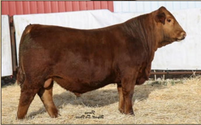
GW Major Move 590E • Sire of Lot 32