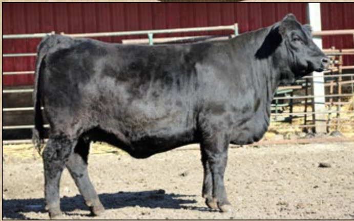
THSR Ms Riddler E736 • Dam of Lot 16