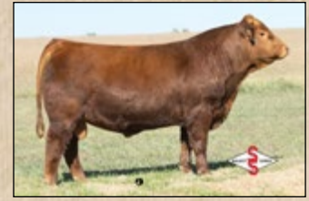
IR Imperial D948 Sire of Lot 2B