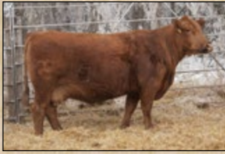
KBHR C078 Dam of Lot 2