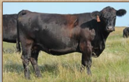
2020 1st calf heifer and her bull calf. Many bull calves out of these heifers make the sale!