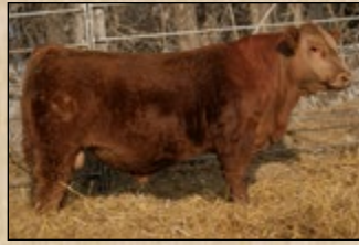
KBHR All American G104 Full sibling to Lot 2A