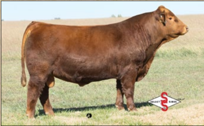
IR Imperial D948 • Sire of Lot 17